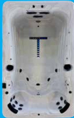
13' Aquex Pro Plus