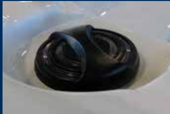
User Friendly Diverters