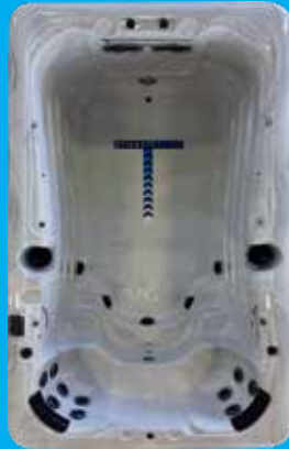
13' Aquex Pro