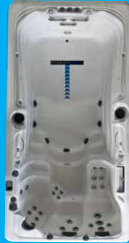
17' Aquex Pro Plus